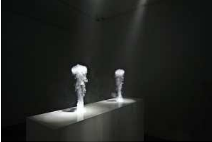
Hiram Wong, Small Bang , 2014, Light, smoke and mixed media, Dimensions variable (Plinth: 200x50x115cm)