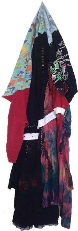
Manish Lal Shrestha, Drapery Project , 2014, Fabric and clothes, Size variable