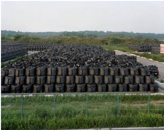
Yishay Garbasz, Storage of nuclear contaminated materials, Route 6, Fukushima(former Exclusion Zone opened in April 2013) , 2013, C-print, 80×100cm