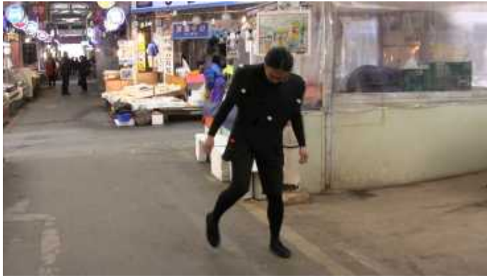
Masayuki Miyaji, project S 002 , 2014, Mixed media, Size variable