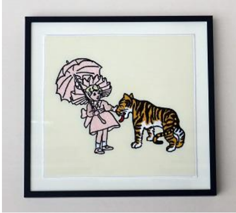
Vibeke Mejlvang, Little Blond Girl meets the Tiger, 2014, Embroidery, 18x19cm