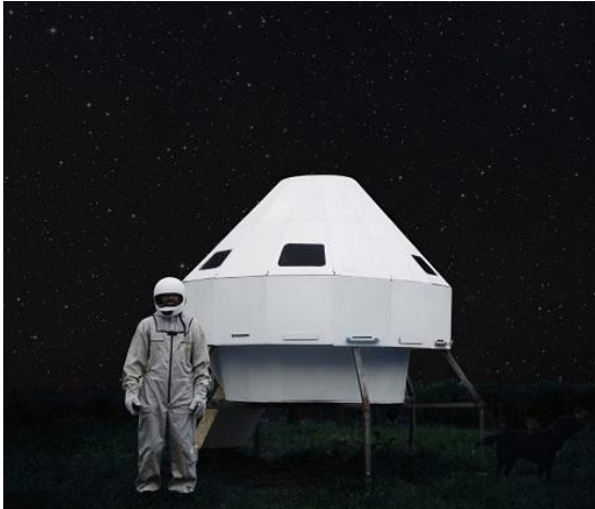
Oto Hudec, DBSP 01, 2014, Wood, plywood, plexiglass, bees, beekeeper's suit, motorcycle helmet, 330x330x370cm