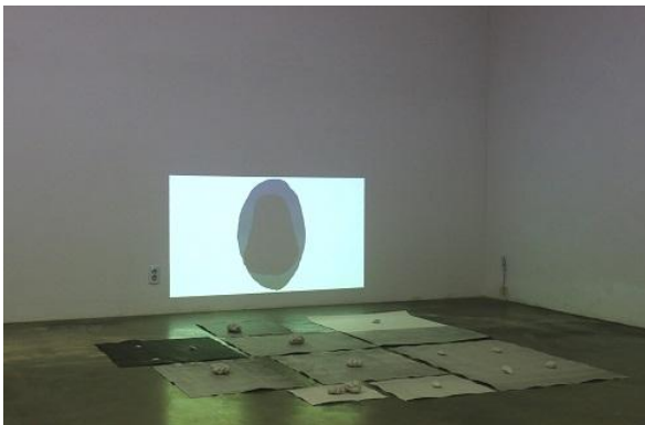
Heide Hinrichs, informal under the roof of your mouth, 2014, Projection, sound, paper, clay, ink and pencil, 350x400cm