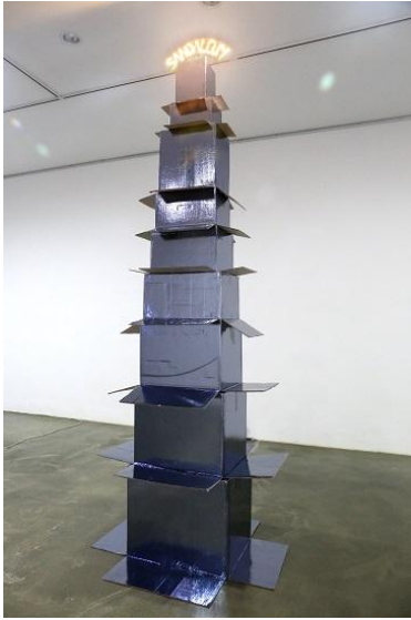
Annesofie Sandal, SANDALEUM, Cardboard boxes, mirror foil and LED light, H327cm, Installation view from the exhibition Silent Review