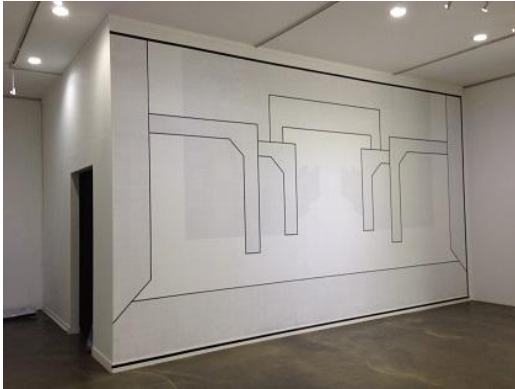
Jena H. Kim, Proscenium, 2014, Tape and paint on wall, 370x600cm