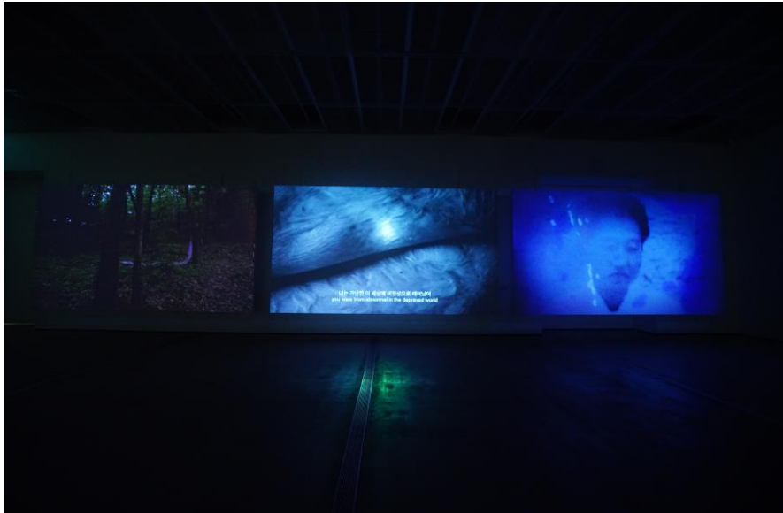
Song Sanghee, Come Back Alive Baby , 2017, 3 Channel video installation, 16'(installation view)