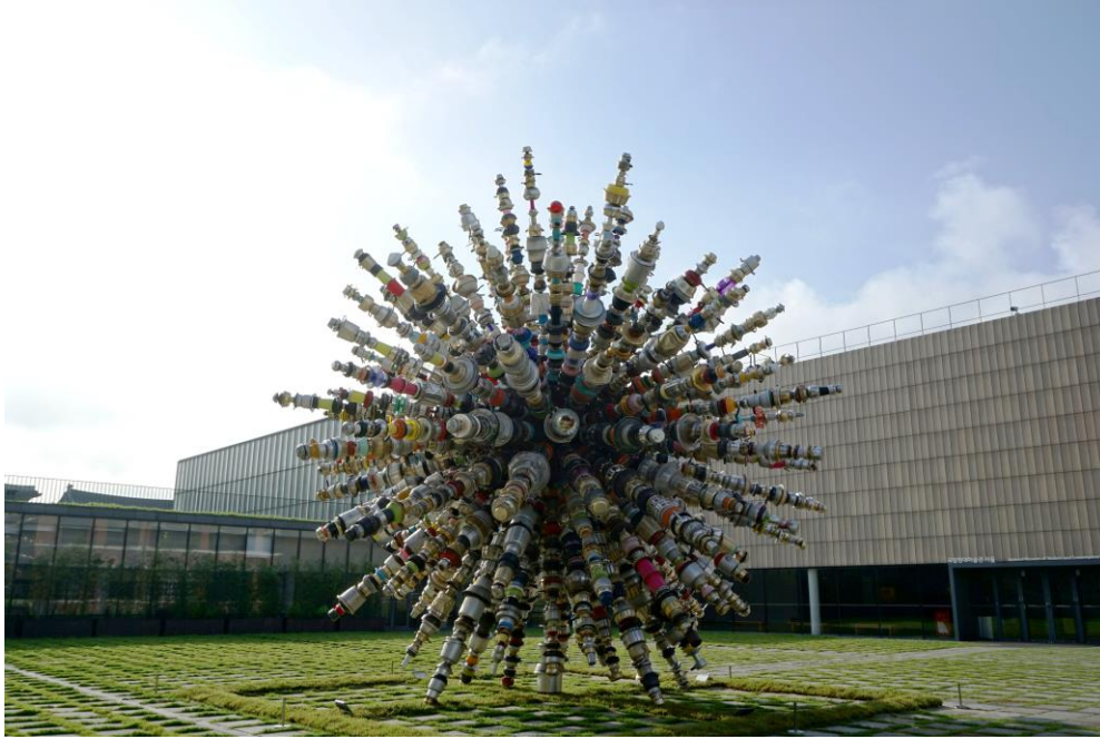
Dandelion, 2018, Used Kitchenware, Steel structure, 9MØ

Dandelion , which will be installed in Museum Madang, is the result of a project that elicited viewer participation. Starting in March, the artist went around Seoul, Busan, and Daegu for Gather Together , a public art project for which he received donations of everyday objects from residents, who joined to make art. The project accumulated approximately 7,000 pieces of tableware that were no longer in use. These comprise the colossal sculpture Dandelion , which measures 9 meters in height, and weighs 3.8 tons. The pots and pieces of tableware in Dandelion were no longer useful at home, but through public participation, these mass consumer goods were transformed into material for art. Dandelion elicits communication between the viewer and contemporary artwork.