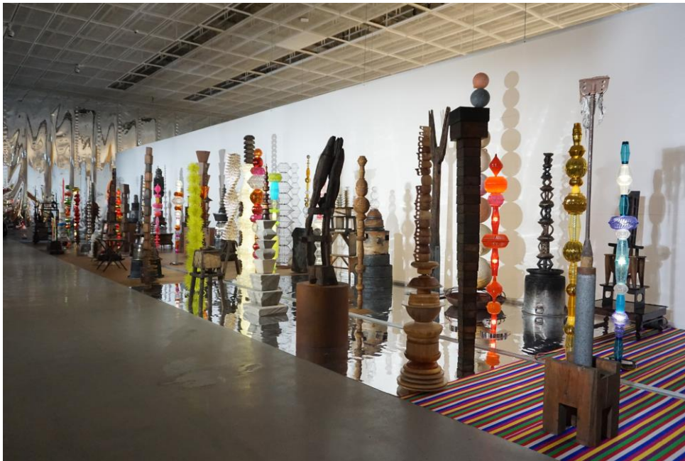
Blooming Matrix , 2016-2018, Mixed media, Dimension Variable

CHOIJEONGHWA's works were featured in such group exhibitions as Museum (1987), Sunday Seoul (1990), and Show Show Show (1992). Throughout the 1990s, Choi designed spaces for youth that blended food, music, exhibitions, performances, and seminars: Bar Ollo Ollo (1990), Space Ozone (1991), and SAL Bar (1996) and Ggool(2010). Surrounded by Korean consumer culture, which underwent dynamic changes in the 1990s, CHOIJEONGHWA drew the club scene and popular culture into art, thereby weaving an intimate relationship between contemporary art and popular culture. The unique sculpting principles of the artist, who deciphered an era, were unfettered by mainstream discourses, which were polarized between Minjung art and Modernism. The artist not only expanded the limits of contemporary Korean art, but also garnered attention in the international arena for works that captured both regionality and universality.